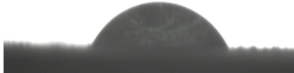
Water on Red Cedar Drop #1 = 68.4°